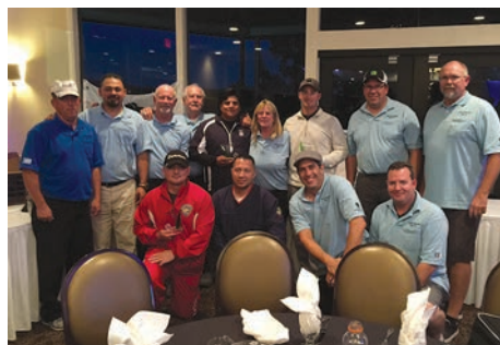
So Cal 117: These board of directors for Club 117 are always proud to support the members of our armed services. Here they pose with some marines who played in the Don Gregson Memorial tournament in May.