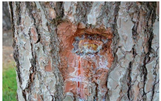
Striking a Blow: Some of the six remaining Canary Island pines have obvious wounds like this one believed to have been caused by an ax. No one has claimed responsibility for the vandalism.

Brian promises to keep us posted on the solutions that evolve through this process. Hopefully there can be positives that come from a difficult situation.