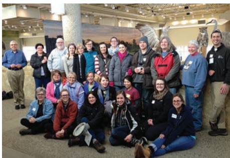
Twin Cities 12: Even with everything else going on getting ready to host the convention, Twin Cities 12 still managed to hold a Project Learn Tree seminar earlier in the year. These are the participants at the Minnesota NWR building.