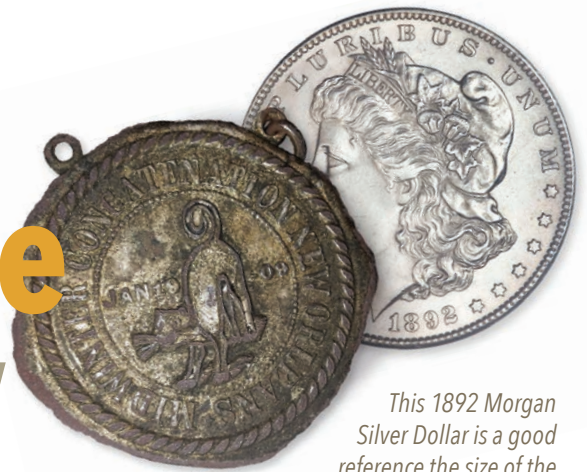
This 1892 Morgan Silver Dollar is a good reference the size of the found concatenation ribbon medallion.